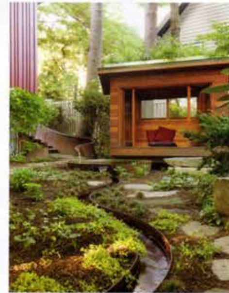
This tranquil meditation hut, designed by Wolf Architects, Inc., overlooks plantings like liriope, creeping Jenny, hellebore, ginger, Clethra alnifolia , and ferns, and is in earshot of the calming sounds of water. Water from the hand rill falls into this circular steel pool in front of the meditation hut and then flows into a curving rill to recirculate over a fountain of stones.

JMMDS designed this ipe deck, which sits in the one sunny spot in the garden, as an extension of the upper deck and steps of the same material. The design of the table, also by JMMDS, was intended to echo the round steel water element near it. "Every detail matters in a small space like this," notes Messervy.