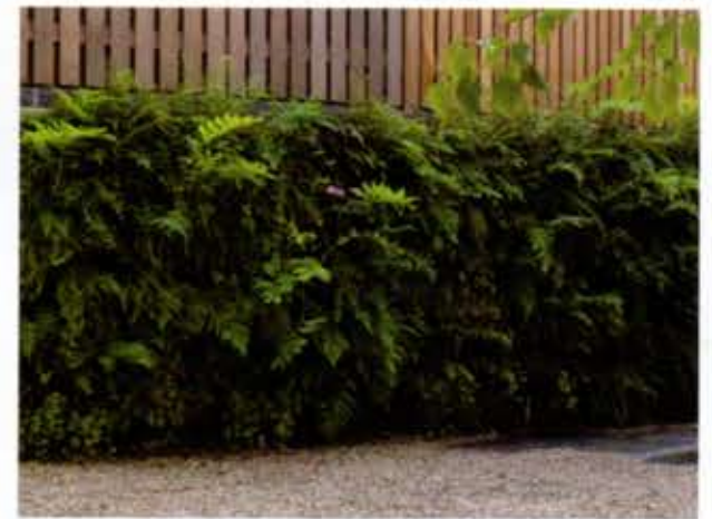
The north-facing living wall at the home's front entry is planted with shade-tolerant perennials. Plants include ferns, such as Polystichum acrostichoides and Dryopteris erythrosora 'Brilliance'; and groundcovers, such as Cornus canadensis , Epimedium x rubrum , Gaultheria procumbens , and Polygonatum humile . The wall, built and installed by g_space and Philly Green Wall & Roof, is a modular stainless-steel system of panels made up of 6-inch-deep angled troughs manufactured by Green Living Technologies International.