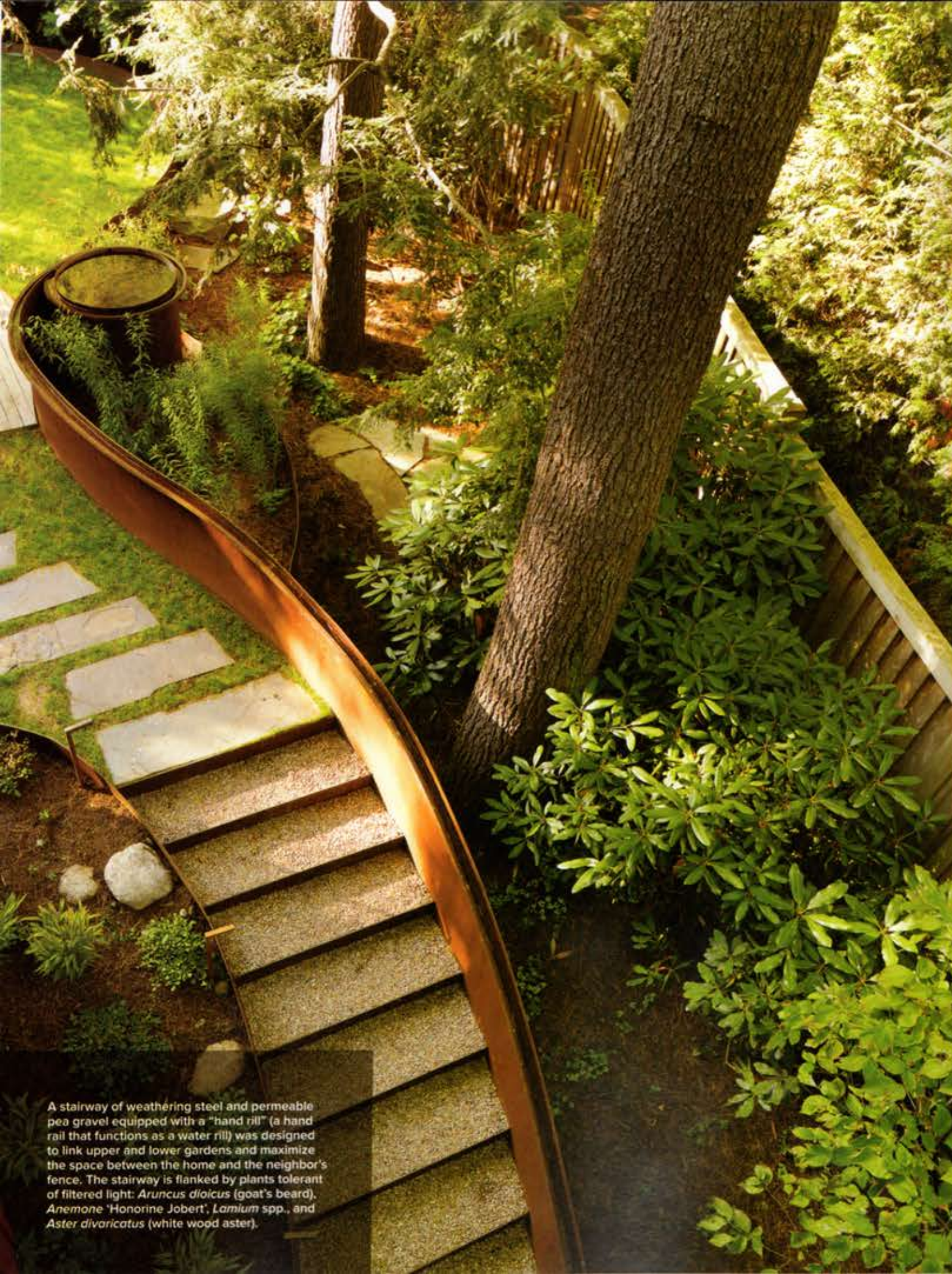
A stairway of weathering steel and permeable pea gravel equipped with a "hand rill" (a hand rail that functions as a water rill) was designed to link upper and lower gardens and maximize the space between the home and the neighbor's fence. The stairway is flanked by plants tolerant of filtered light: Aruncus dioicus (goat's beard), Anemone 'Honorine Jobert' , Lamium spp., and Aster divaricatus (white wood aster).

This steel water element functions as a bubbler, a soothing feature for the owners to enjoy. From here, water circulates to the hand rill along the steps, and to the larger pool at the meditation hut. The curves of the hand rill and steel edging were precisely planned; Messervy explains that they had to "connect to each other and visually sing back and forth." Steel work fabricated and installed by artist Peter Andruchow and sculptor Richard Duca.