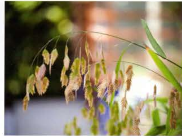
The seed heads of Chasmanthium latifolium (northern sea oats) provide texture to the garden almost year-round. This is one of many shade-tolerant native plants JMMDS incorporated throughout the property.